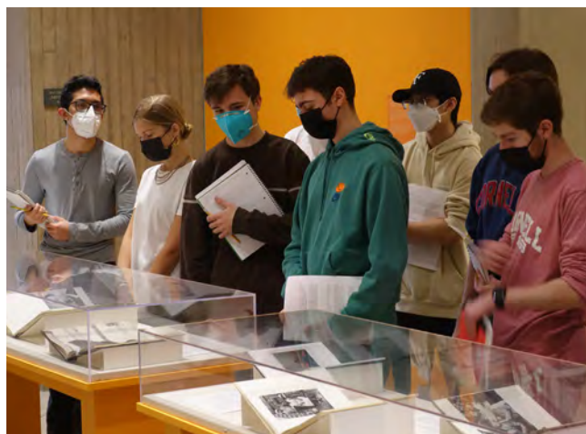
A class visits the Spring 2022 exhibition Resistance Is Personal: The Photobook as Protest , curated by students in a Fall 2021 Curatorial Practicum.