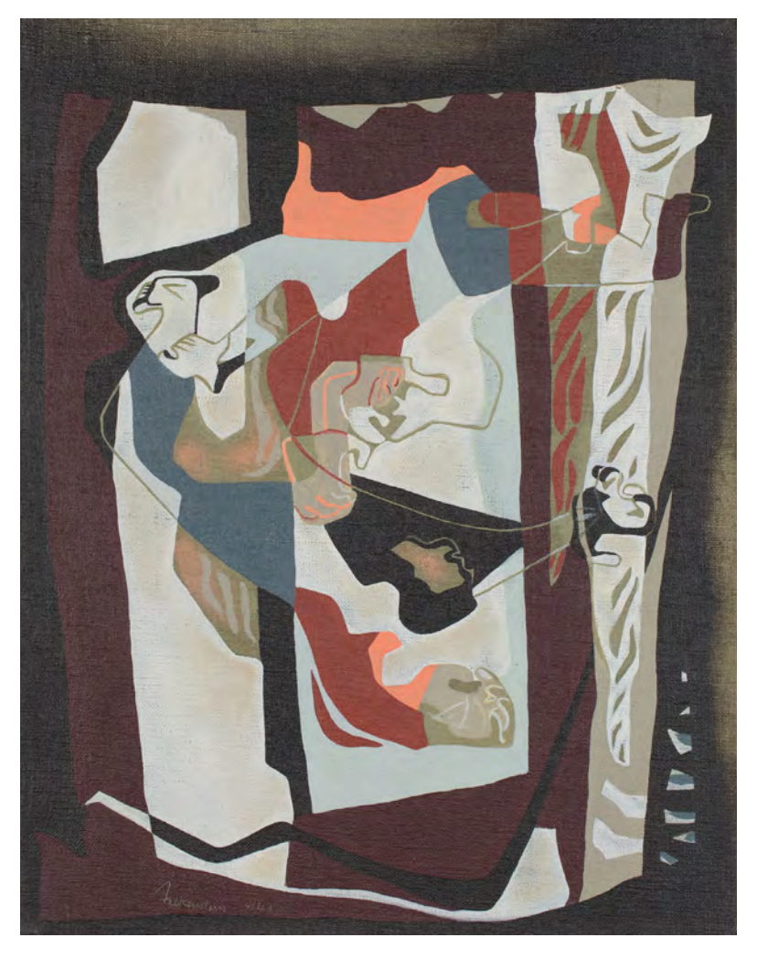
Claire Falkenstein American, 1908–1997 Action in the North Atlantic No. 3 (The Plunge Overboard No. 2), 1943 Oil on canvas 18 1/4 x 14 1/4 inches Acquired through the David Findlay, Jr., Class of 1955, MBA 1957, Fund 2018.069