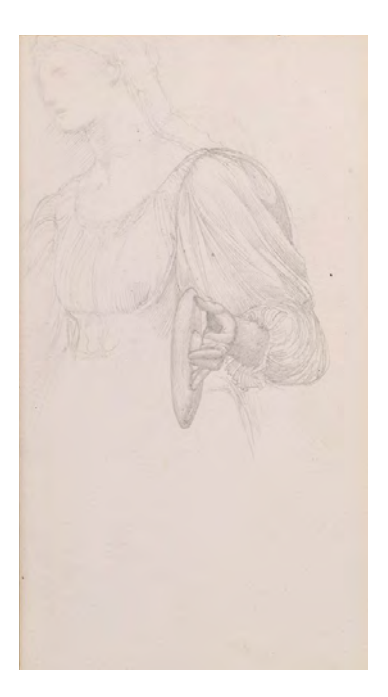
Edward Coley Burne-Jones British, 1833–1898 Three studies for The Golden Stairs Pencil on paper 10 x 5 ½ inches ((25.4 × 14 cm), each Acquired through the Frank and Margaret Robinson Prints, Drawings, and Photographs Endowment 2019.006 a-c