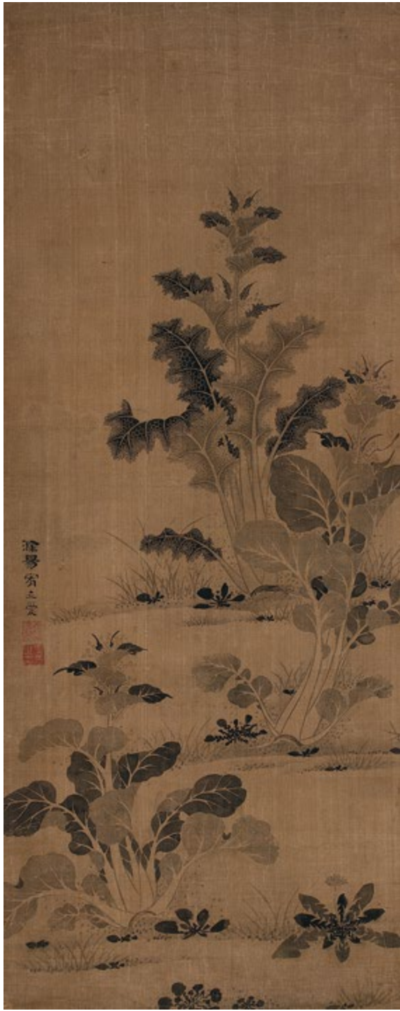
Yu Li-ai Chinese, active 13th–14th century Cabbage, Kale, Dandelions, and Grasses Hanging scroll: ink on silk 28 \frac{1}{16} × 11 \frac{1}{4} inches Acquired through the Lee C. Lee Endowment for East Asian Art 2016.032