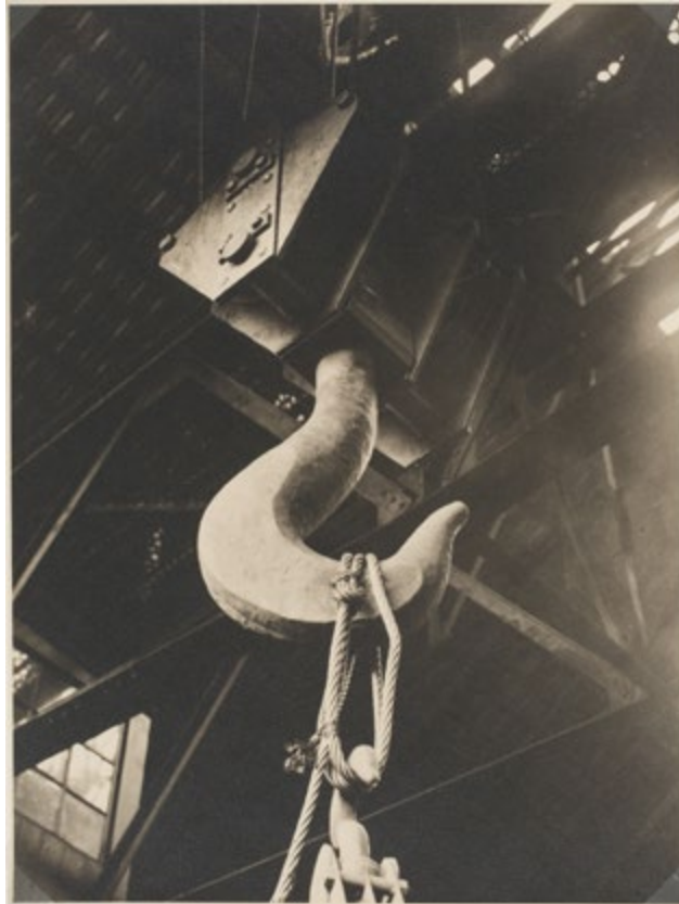
Albert Renger-Patzsch German, 1897–1966 Industrial study , 1930s Gelatin silver print 9 × 6 ¾ inches Acquired through the Class of 1962 Fund for Photography 2017.017